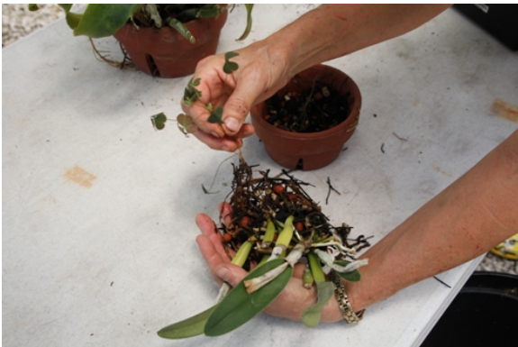
4. The tried and true way of eliminating weeds is to replot the orchid being careful to remove all the invading roots along with old media.

I decided to do a trial run using the paint brush approach with the granular herbicide Diuron (80% active ingredient) that is also sold as Karmex, Parrot, Di-on and a few other trade names. Even with trying different strength solutions from a paste to a flowable liquid and using 6 different brushes, from a small painter's brush, sponge brush and finally a kid's paintbrush, the painted application could not be confined to just the weed leaves. No matter how small the paintbrush or how carefully you try to apply the herbicide, some drips off onto the orchid roots or the weeds are growing in crevices so you end up painting the orchid along with the weed. It is time consuming, sloppy, and the weed surface seems to repel the herbicide. The paste and the solution were also probably more concentrated than desirable so this experiment was curtailed and labeled a failure.