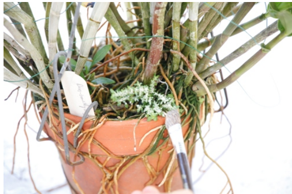
5. Painting the weed surface with a small paint brush was tedious and sloppy and the weed surface seemed to repel the herbicide.

Selective Spraying. Perhaps there is a middle ground between broadcast spraying your orchids and painting your orchids with herbicide. How about a spray bottle filled with a somewhat dilute herbicide solution selectively sprayed only on the weeds rather than spraying the entire plant? Using about one third the dosage recommended by Bing for cymbidiums, a spray bottle was filled with water to which Diuron was added at a rate of 0.25 tsp/qt (1.3 cc/l) along with a little dish soap as a surfactant. Time to do battle with the weeds.