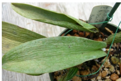
2a. Fusarium Wilt caused by Fusarium oxysporum in a cattleya. Fusarium is spread largely by the use of unsterilized cutting tools and pots.