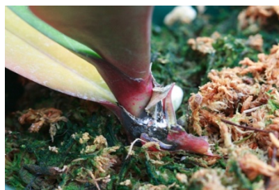
2c. Southern Blight aka Collar Rot caused by Sclerotium rolfsii in a phalaenopsis. If the infection reaches the crown of the plant, it will die.

Fungal rots can be slow growing diseases that infect roots, stems and bulbs on orchids, ultimately killing them. After sanitizing the plant by cutting away infected tissue, help prevent spread of the disease by applying drench applications of the relatively affordable Daconil or one of the more specialized and expensive chemicals labeled for these diseases, including Heritage and Pageant.