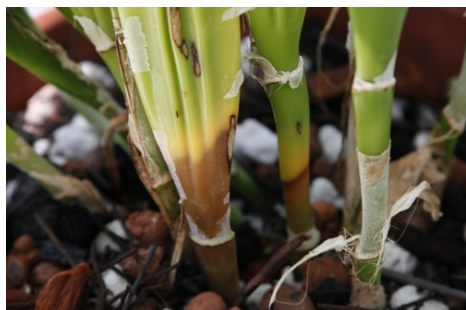
3. Black Rot caused by Pythium ultimum and Phytophthora cactorum on a cattleya. This fast moving disease requires immediate intervention or the whole plant can be lost. Avoid repotting and excessive wetness during the hot humid weather in which these pathogens proliferate.

Water Molds. There is a very fast moving rot caused by water molds (fungal-like parasites called oomycetes) that results in pseudobulb rots and damping off of seedlings. This group of pathogens causes sudden oak death, downy mildew and the disease that caused the 19 th century great potato famine. This