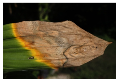
4c. Leaf dieback or Anthracnose, by Gleosporium and Colletotrichum species in an stanhopea. Fruiting bodies develop on dead leaf portions leaves spreading the disease.

Leaf spotting fungi penetrate plant openings particularly during periods of warm temperature and leaf wetness. The fungi produce toxins that kill the host cell and the lesion is sometimes surrounded by a yellow halo. The disease is spread from spores on the discolored part of the leaf. Treat affected leaves with copper, quaternary ammonium compounds or other specialty chemicals like thiophanate methyl. If the infection is serious or continues to enlarge, remove the infected leaf to an inch below any discoloration.