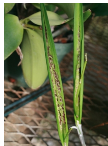
1c. Bacterial Brown Spot caused by Acidovorax (syn. Pseudomonas ) cattleya on a nodosa hybrid

Bacterial infections are highly contagious, spread easily by plant exudations and splashing water. The pathogens favor warm and wet conditions. If found, quickly remove any diseased tissue and treat with an appropriate chemical to prevent spread of the disease. Keep a spray bottle of hydrogen peroxide handy in your growing area as a topical disinfectant. During hot, humid weather, consider preventative sprays, reducing leaf wetness and increasing air movement to prevent occurrence.