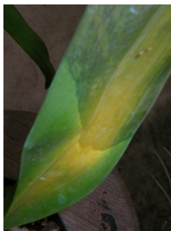
1a. Bacterial Soft Rot caused by Pectobacterium (syn. Erwinia ) cartovora or chrysanthemi on an oncidium