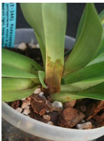
1b. Brown Rot caused by Pectobacterium (syn. Erwinia ) cyripedii on a paphiopedilum