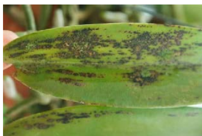
4b. "Thai Crud" caused by Guignardia on a vanda. Spores are present on the raised diamond shaped lesions that feel like sandpaper. These spores spread the disease.