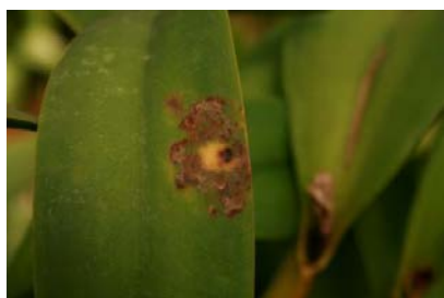
4a. Leaf spotting caused by Cercospora species on a cattleya. The leaf spot continues to enlarge and can kill the entire leaf.