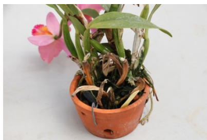
2b. Root Rot caused by Rhizoctonia solani in a cattleya. Populations of this fungus can reach high levels in degraded potting mix.