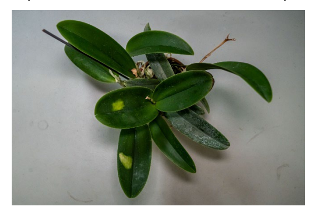
Splotches of slighted raised light green tissue on upper leaf surface, no sporing bodies on either surface, spots almost look like they are bleached as if close to sunburn.

The most important ways in which leaves dissipate excess heat is through convective cooling, where heat is transferred from the leaf to the air circulating around it, and evaporative cooling, where transpiration of moisture through the stomata removes a large amount of heat, cooling the leaf. Proper plant shading during the hot summer months to reduce light intensity along with good air movement and good irrigation practices help dissipate excess heat and are critical to preventing sunburn.