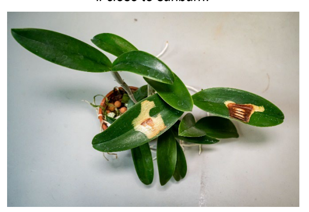
Two large blotchy spots, but not on the highest point of the leaf where you would expect the sunburn to occur. Bleached sunken light tan spots, has brown scarring sunken tissue over bleached areas. In area of worst damage, there is brown showing on the leaf underside.