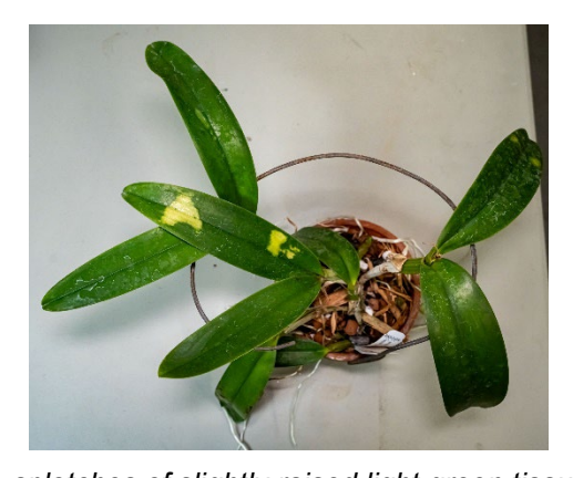
Two splotches of slightly raised light green tissue on upper surface, one would be in right place for sunburn and the second wouldn't be, nothing on leaf undersides.

Once you've tortured your plants a few times, you learn that sunburn has a pretty distinctive appearance. Sometimes a leaf can be damaged just short of being sunburned and have a bleached look, but the damage always first appears on the highest point of the leaf exposed to the most direct sunlight. There were some plants in the greenhouse that had that bleached sort of pre-sunburn look, but the damage was not where it should have been.