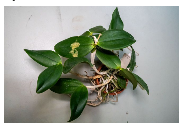
Bleached area of slightly sunken light tan tissue on upper surface of leaf. Visible veins in leaf in bleached area. No markings on leaf underside.