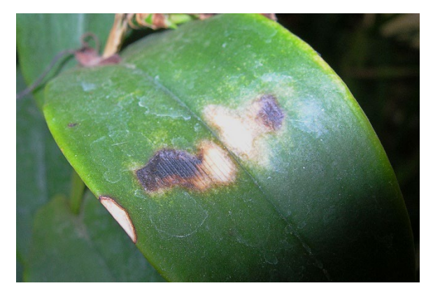
Sunburn typically occurs on the high point of the leaf where the sun angle is most direct

All plants have a light saturation point, where the photosynthetic response to light levels tapers off. More sunlight beyond the light saturation point will not cause an increase in photosynthesis. For most plants, the light saturation point occurs at about 25 to 50% of full sunlight. When exposed to excess light, leaves must dissipate the surplus absorbed light energy to prevent damage to the photosynthetic apparatus, otherwise known as sunburn.