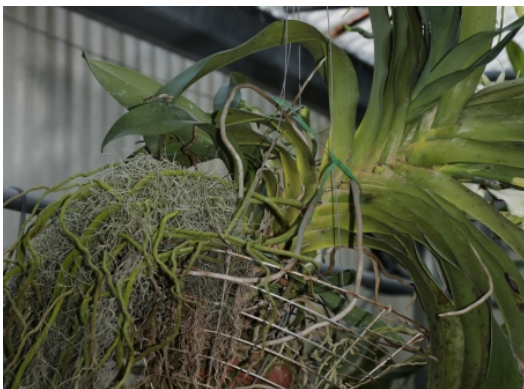
7. It's not the most attractive presentation, but you can drop overgrown clay pots into a wire basket. This seemed preferable to disrupting the Angraecum roots.

Wire Baskets. Wire baskets are not the most attractive baskets in the world but they are sturdier than plastic. You can drop an overgrown pot into a basket and delay the inevitable repotting for several years. You can also mount orchids on an upside down basket. You can cover it with sheet moss, coconut fiber or a premade coconut fiber liner (get them unwaxed, and do not forget to remove that pesky plastic layer in the middle layer).