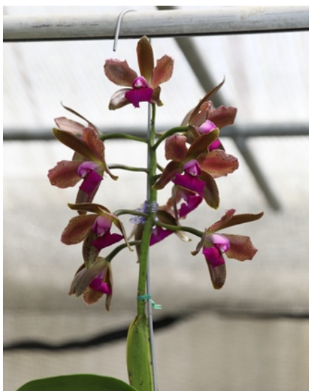
9. If you have an overhead structure, you can hang S hooks for tall spikes.

16 Gauge Wire is used typically on the three and four wire basket hangers, sometimes a slightly thicker 14 gauge wire is used. The wire is thin, easily bent and cut, and is strong enough for most hanging baskets by virtue of the fact that three or four strands together do the work of holding the baskets. These come in various lengths so you can match the plant height to the wire length.