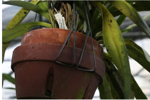
6. Add a second wire hanger for stability when hanging larger and heavier pots. The extra strength helps keep them from dropping.

Clay pot double wire hangers have a different structure for holding the wider clay rim. Sometimes the tension in these hangers has to be adjusted to ensure a tight fit. Another tip from Keith, push the tension arm in while pushing it from side to side at the same time. For very heavy or large pots, you can use two hangers to share the work of holding the pot.