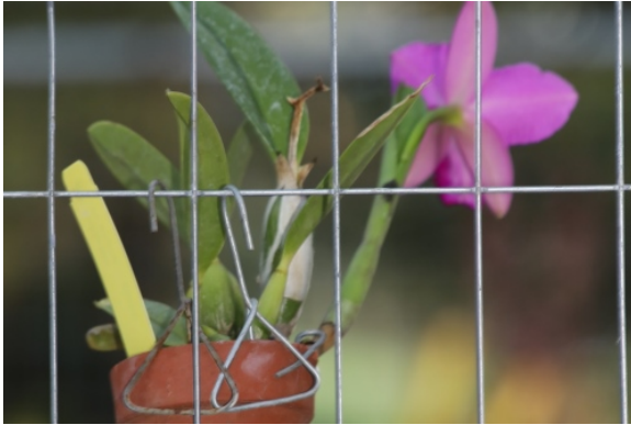
5. Using two single wire hangers side by side helps plants not twist in the wind, while hanging from a vertical wire structure.