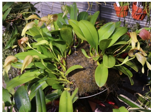
8. You can mount bulbos on an inverted wire basket topped with a coco fiber liner, just remember to remove that plastic inner liner from the coco.