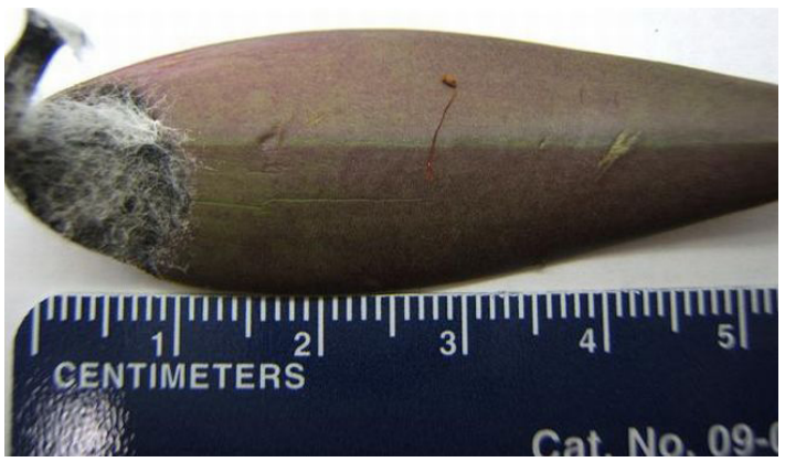
Figure 5. Cattleya hybrid. White hyphae containing sporangia can be seen on basal portion of leaf.