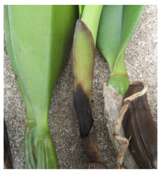
Figure 2. Cattleya sp . Close up view of black rot symptoms caused by Phytophthora cactorum .