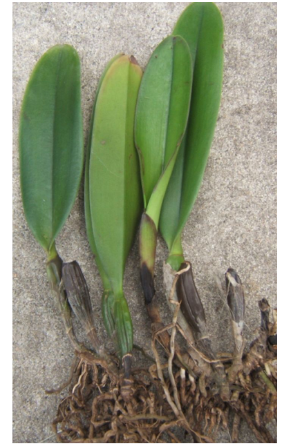
Figure 1. Cattleya sp. Black rot symptoms caused by Phytophthora cactorum .

Small black lesions can be observed on the roots or basal portions of the pseudobulbs. As the lesions age, they enlarge and may engulf the entire pseudobulb and leaf (Figures 1 and 2). The pathogen can spread through the rhizome to other portions of the plant. Eventually, the entire plant will be killed.