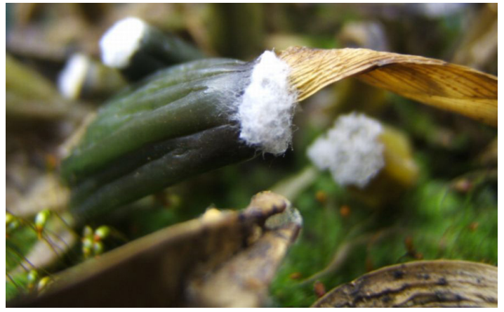
Figure 3. Cattleya hybrid. White mycelium containing sporangia of Phytophtora palmivora can be seen on the end of pseudobulbs.