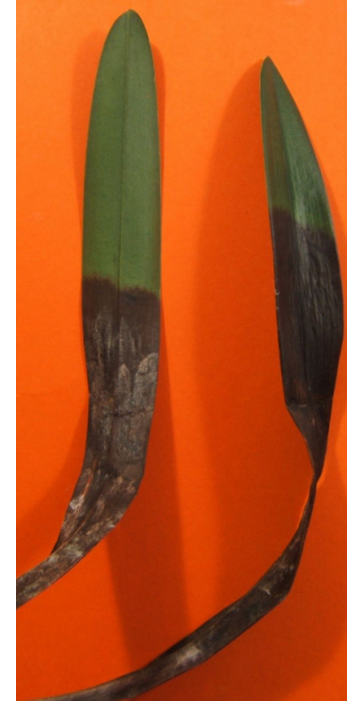
Figure 6. Oncidium hybrid with black-rot caused by Phytophthora palmivora .