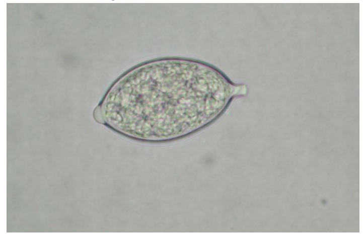
Figure 7. Sporangium of Phytophthora palmivora . Sporangium is papillate and ovoid with a short pedicel.

In most cases, identifying the pathogen to genus will provide enough information to identify proper prevention and control strategies.