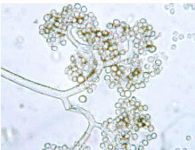
Pictured: A conidiophore of Botrytis cinerea producing characteristic "grape-like" clusters of conidia.

When it comes to effective management of prolific pathogens such as Botrytis, preventative fungicide applications are a must. It's critical that individuals making fungicide application decisions follow the manufacturer's recommendation for proper rates and application intervals. Several fungicides have been developed for use on ornamental plants for controlling Botrytis (refer to table).