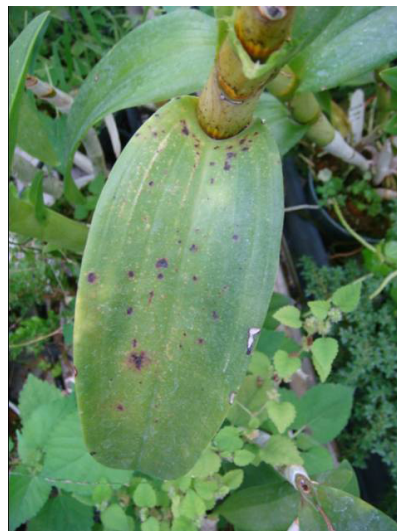
Fig. 2. First noticeable disease symptoms.

The disease occurred as a severe blight affecting over 90% of 500 potted nursery stock during periods of cloudy, rainy weather from July through Sept. 1991 and 1992. Grade and standard reduction resulted from a severe foliage blight. This epiphytotic occurred during an abnormal period of excessive rainfall and high temperatures. Colletotrichum gloeosporioides was reisolated consistently from the diseased tissue. Disease symptoms were first noted on the leaves 10 d after inoculation and began as small circular spots that appeared water-soaked or scalded (Figs.