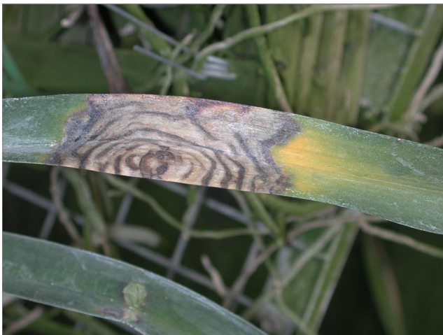
Fig. 4. Anthracnose on mature lesion.

2 and 3). The spots enlarged to 25 mm or more, became tan with a darker border, were sometimes zonated (Figs. 3 and 4) and after that described by Burnett (1974). The undersurface of the leaf appeared as pale yellow sunken spots, 1–3 mm in diameter. With time, the spots continued to enlarge in a circular or irregular pattern and eventually covered the whole under side of the leaf. Later the spots became slightly sunken and purple-black with the developing margin remaining yellow. Following the appearance of the spots on the lower leaf surface a corresponding yellow-pale green area was seen on the upper leaf surface. Eventually these spots turned purplish black or black. Heavily infected leaves abscise. Prolonged periods of leaf wetness should be avoided.