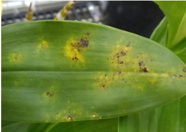
8. This dendrobium leaf is infected with one of the leaf spotting Cercosporoid fungi. This seems to be contagious in dendrobiums, remove the leaf.

spray the plant with a suitable fungicide such as one containing chlorothanil (trade name Daconil) or thiophanate methyl (trade names Banrot, Cleary's 3336 or Thiomyl). These dendrobiums are grown in the heated greenhouse along with the cattleyas.