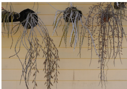
6. The pendent soft canes often drop their leaves during the winter and develop buds in early spring.