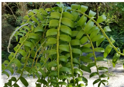
5. The pendent seminobile dendrobiums have beautiful green foliage by summer's end.

Catasetums, clowesias, cycnoches and mormodes as well as a few others like calanthe are dormant during the winter months. They need no water at all until the new growth starts in the spring. Find a place to group these together where you know you will not water them. Some people turn the pots on their sides to remind themselves.