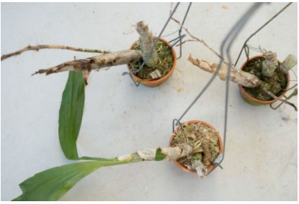
When last year's growth is leaning in the pot it is not firmly anchored in the mix. Repot these so the new growth will be stable in the pot.

The other thing to evaluate is the general health of the pseudobulbs, particularly the oldest bulbs. It is not unusual for the older bulbs to be a little dessicated from their dry winter dormancy, but if there are soft spots or black markings, you may have some latent rot in the bulbs that should be removed. If you see keikis forming on nodes halfway up the plant, the likelihood is there is a rot problem that requires your attention.