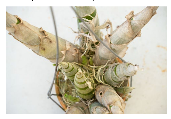
Some varieties, like this Fredclarkeara, grow multiple thick pseudobulbs with no hint of rotting in the older growths. These can be up-potted into larger pots keeping all the bulbs together for a great floral display later in the year.

aeration. In spring they are watered every other day if it doesn't rain, and after the growths mature they may be watered every third or fourth day, with longer periods of drying out after extended rainfall events. You can always tell how well your system of potting and watering has worked during the subsequent year repotting when you can see the root system that developed inside the pot.