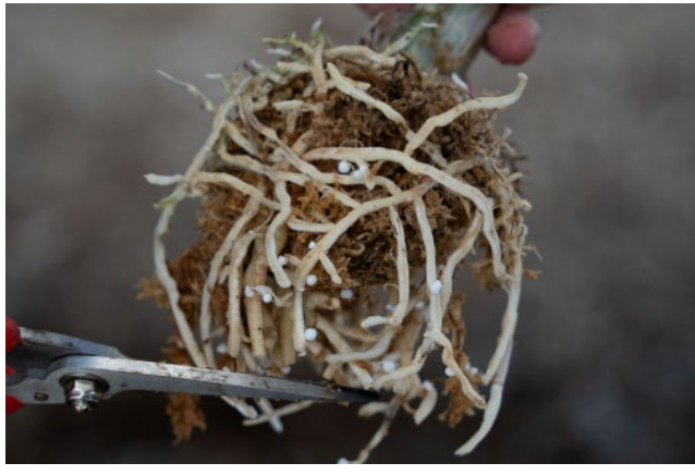
If the roots don't look great, just remove them. The new growths will rapidly produce a new set of roots.