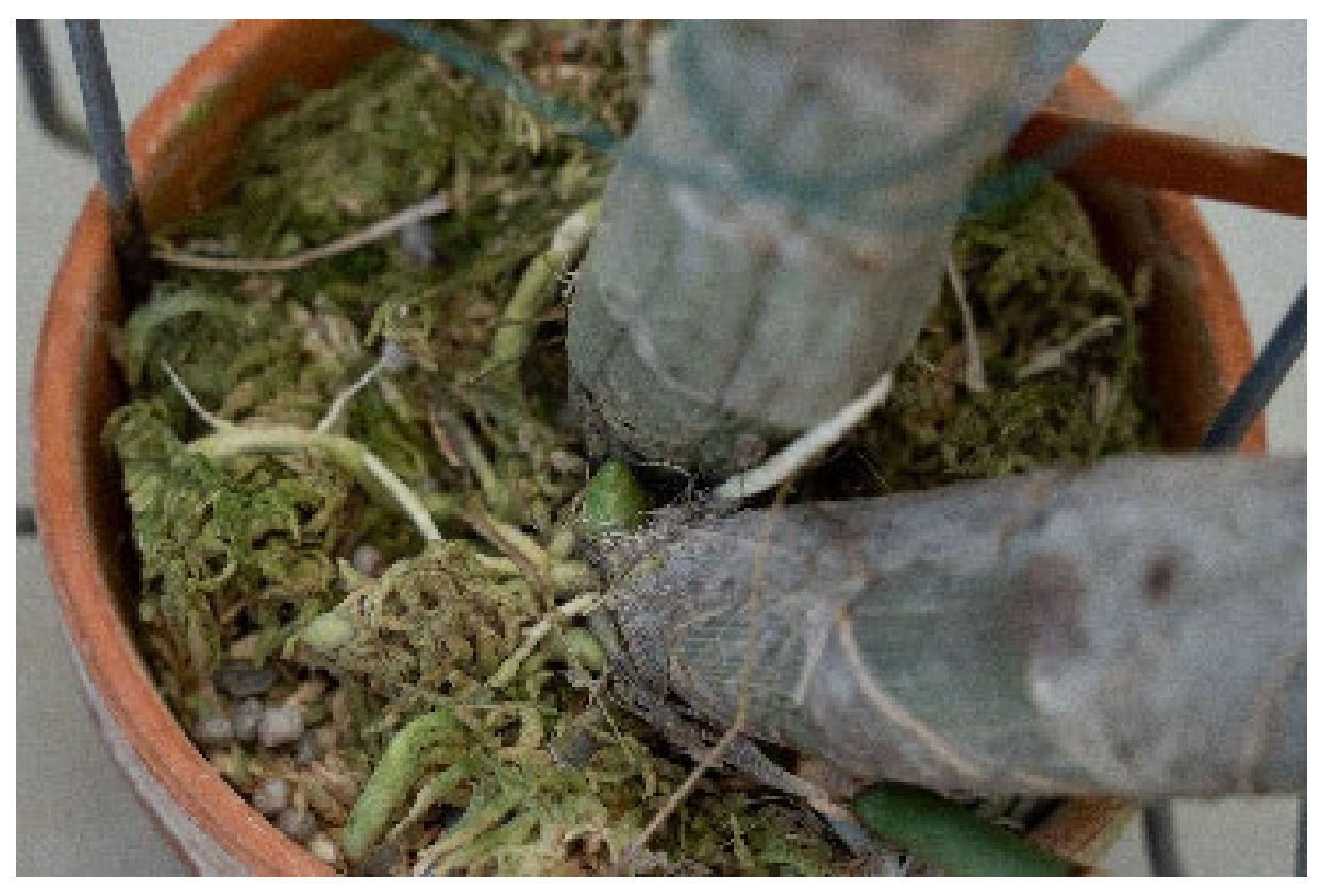
Check all your catasetums each week starting in December. Pull any that have started their new growths, like the one emerging in the very center of this image. Now is the time to repot this catasetum, if it needs to be repotted, so that it will be in fresh media before the new roots begin to form.

When you see the new growths starting at the base of the catasetum bulbs, you know the repotting season has begun. If the plant needs to be repotted, this is the time. You want to have the plant in its new home before the roots begin to form under the new growth. If you start repotting after those roots start growing, it is almost impossible not to damage them. Much better to have them nestled in their new potting mix a few days before the roots emerge. You have perhaps a week or two of leeway to get into the repotting mode from the time that the new growth begins, so the first question you have to ask yourself is does my catasetum have to be repotted this year?