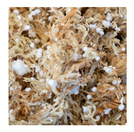
Fluffed and moistened sphagnum moss with grated Styrofoam is my choice of potting media.

Potting Materials and Containers. You can grow catasetums in almost any potting mix or container as long as you adjust your watering habits to meet the plants needs throughout its annual growth cycle. Most catasetums have a dormant winter season, followed by a period of explosive growth in the spring until the bulbs mature in the summer and slowly harden off in anticipation of the coming dry season and dormancy. This means they require ample water and food during the growth season. My catasetums grow in an open shade house during the summer months where they get watered by Month Nature, including during the Tropical Storm Season. They are in clay pots filled half way up with Styrofoam and the upper half of the pot is mostly New Zealand Long Fibered Sphagnum Moss with either grated Styrofoam of sponge rock mixed in for improved