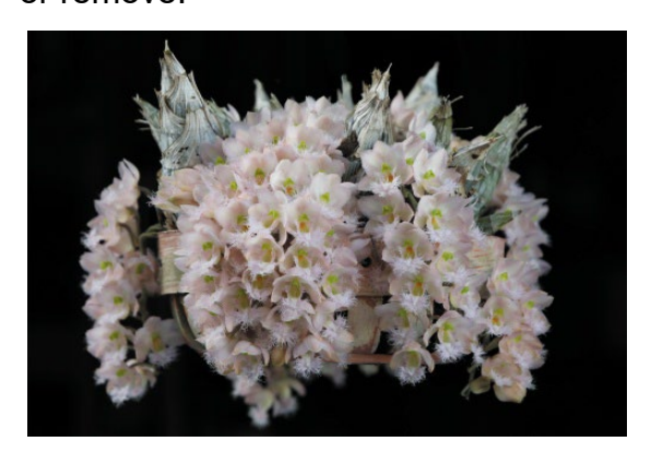
Clowesia Grace Dunn 'Chadds Ford' AM/AOS is a late bloomer, in the February/March time frame. Let it bloom first, and then repot when you see the new growths starting.

Sometimes your catasetums begin their next growth phase without an intervening dormancy cycle. No worries, you can still repot the plant if it needs it. You will just use the condition of the roots to guide you in deciding how much of the existing root mass to keep or remove.