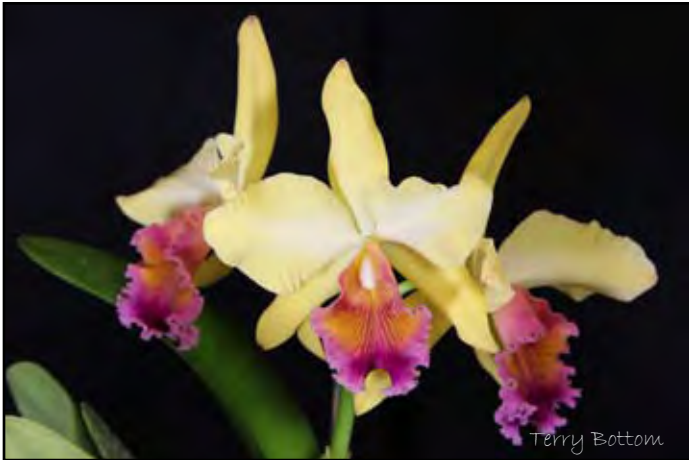
Grower Sue Bottom Blc. Toshie Aoki x Pot. Lemon Tree