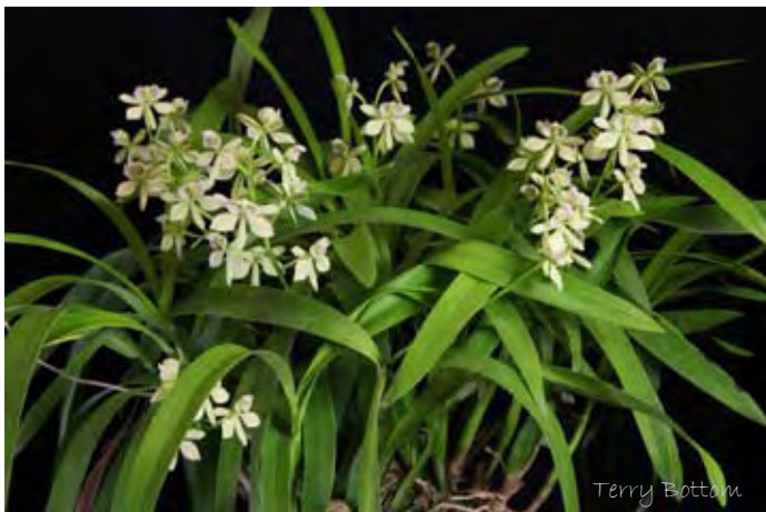
Grower Sue Bottom Enc. radiata