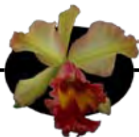
Stan. King Kong 'Crypt' HCC/AOS