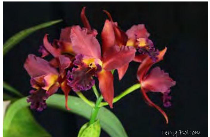
Grower Courtney Hackney Blc. Cherry Suisse