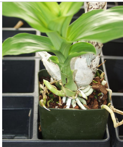
Start watering now, roots 3-6" long and into the medium