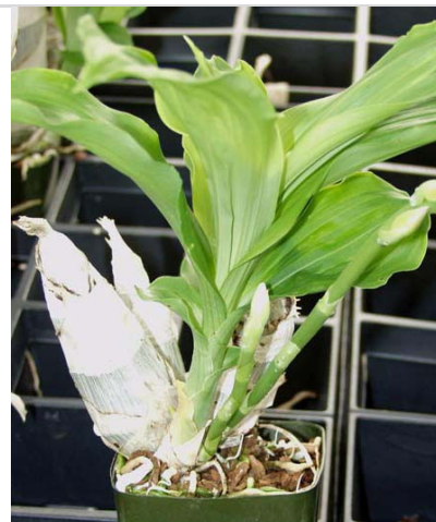
Fully rooted plant, top growth 10" water and fertilize regularly