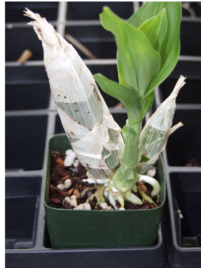
No water, roots just starting to show.